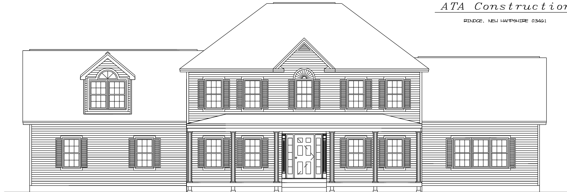
THE CRAFTON I