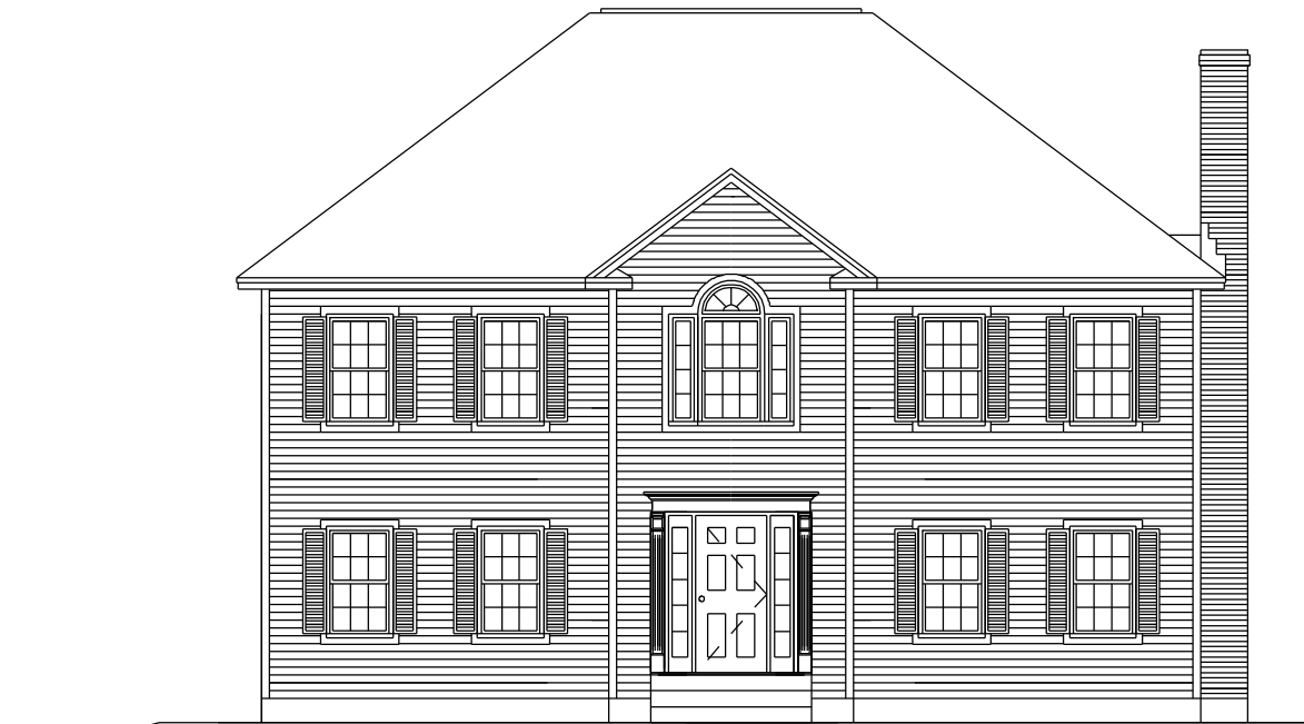
THE DURHAM III